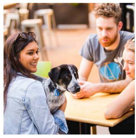
Atticus Finch Cafe, Paddington